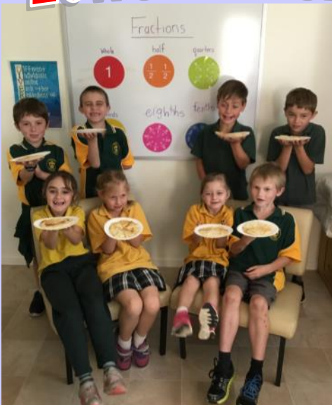
Learning about fractions with Pikelets