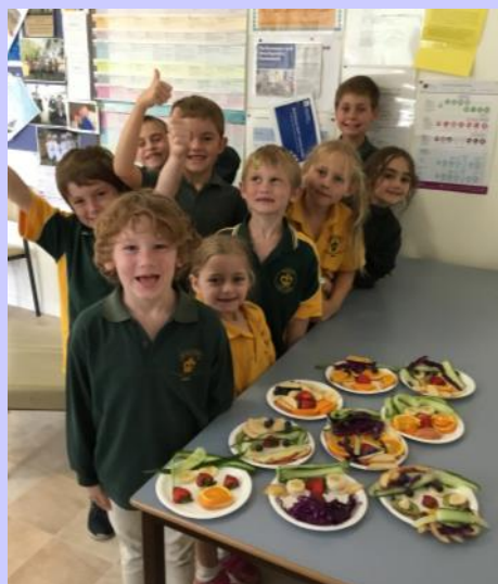
Fruit faces inspired by the work of Giuseppe Arcimboldo